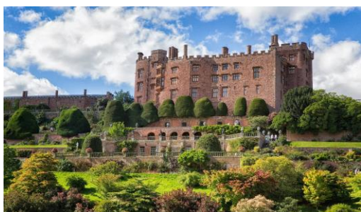
Powis Castle and Gardens

We depart by coach from Solihull Methodist Church and travel to Powis Castle and Gardens (NT) . Influenced by French and Italian styles, this amazing garden is cared for by the National Trust and has some of the most flamboyant and stylish herbaceous planting of any garden in the British Isles, as well as billowing yew topiary and magnificent views over the River Severn and Border countryside. The castle was originally built in the early 13 th century as a medieval fortress. It has been remodelled over the years and each generation has added to the magnificent collection of sculpture, furniture and paintings. We will have time to thoroughly explore the gardens and to purchase lunch.