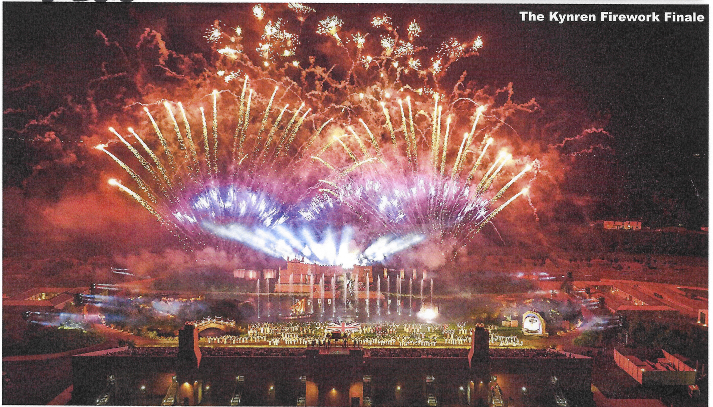
The Kynren Firework Finale